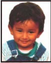
Born : 27th April 1989 Deceased : 8th October 1993