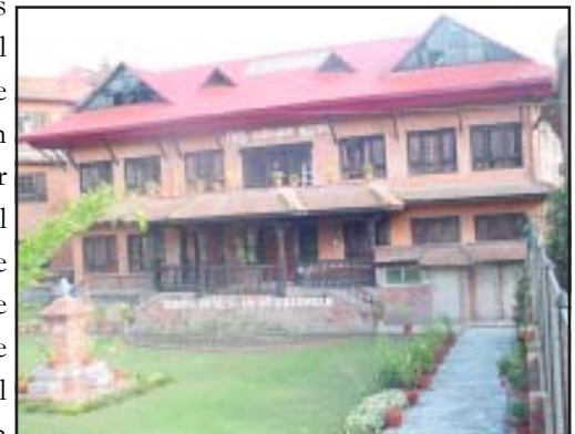
SIDDHI SHALIGRAM BRIDDHASHRAM